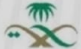
General Directorate of Health Affairs in Medina